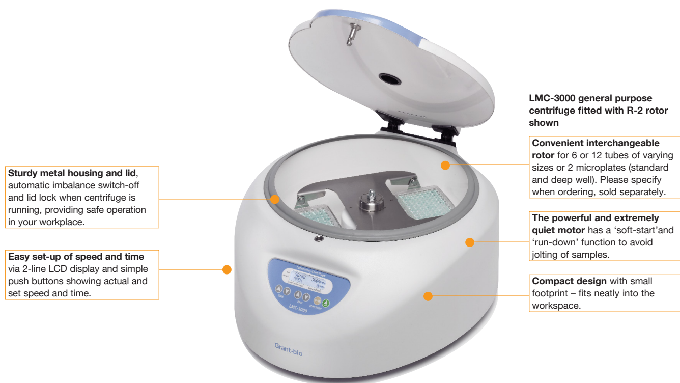
LMC-3000 general purpose centrifuge fitted with R-2 rotor shown

Convenient interchangeable rotor for 6 or 12 tubes of varying sizes or 2 microplates (standard and deep well). Please specify when ordering, sold separately.