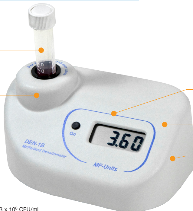
DEN-1B densitometer shown

DEN-1 and DEN-1B units are calibrated for operation in range 0.3-15.0 McF and 0->15.00 McF, but it is possible to measure turbidity from 0McF to 15McF (note: the standard deviation of the values increases).